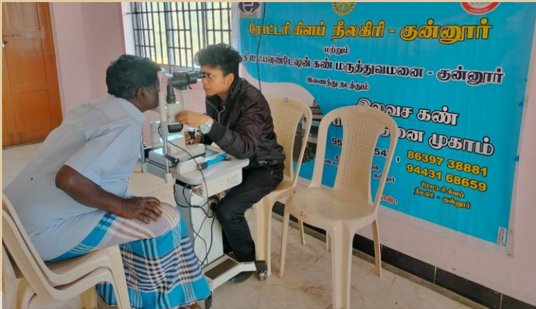
07/01 @ Town Peruratchi Glasses Provided: 10